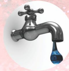
Potable Drinking Water