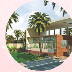
Grand Entrance Arch